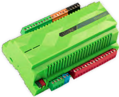
Loxone MiniServer (example)